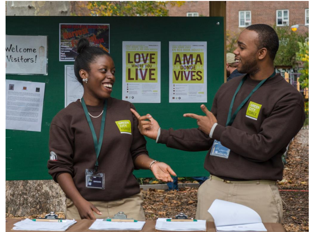
Love Where You Live