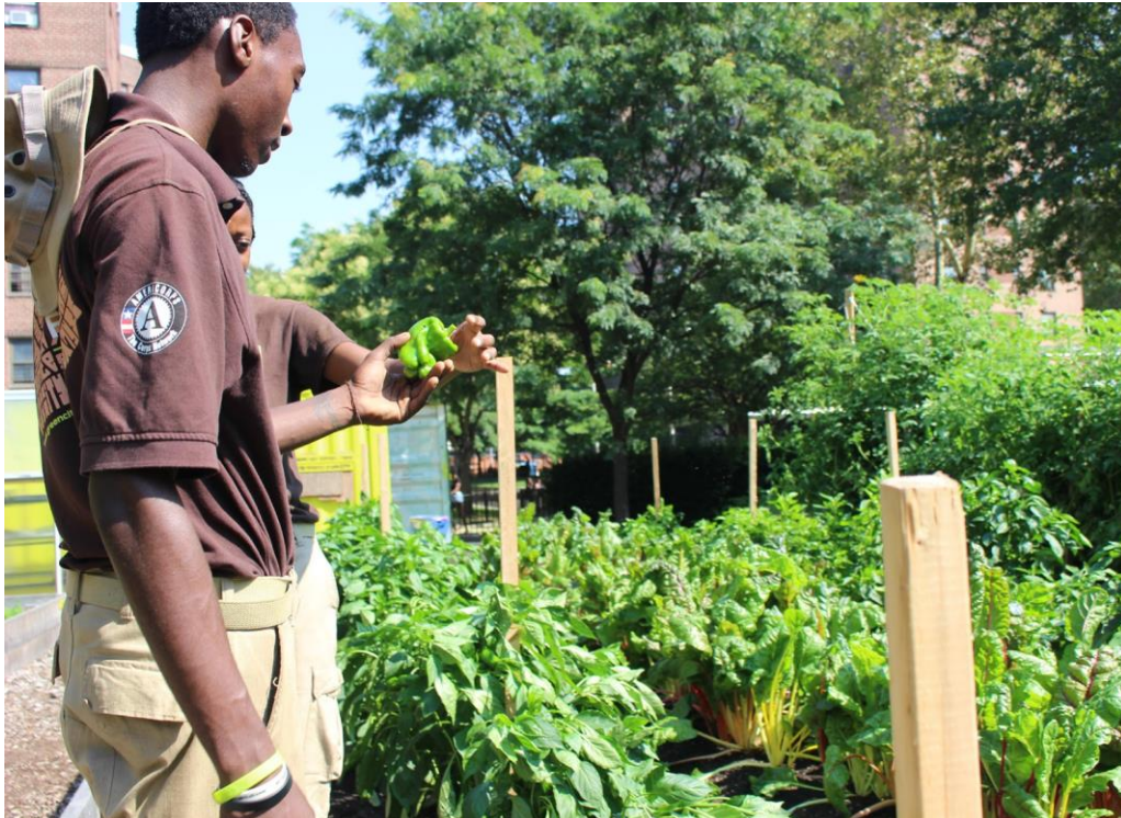
Farms at NYCHA